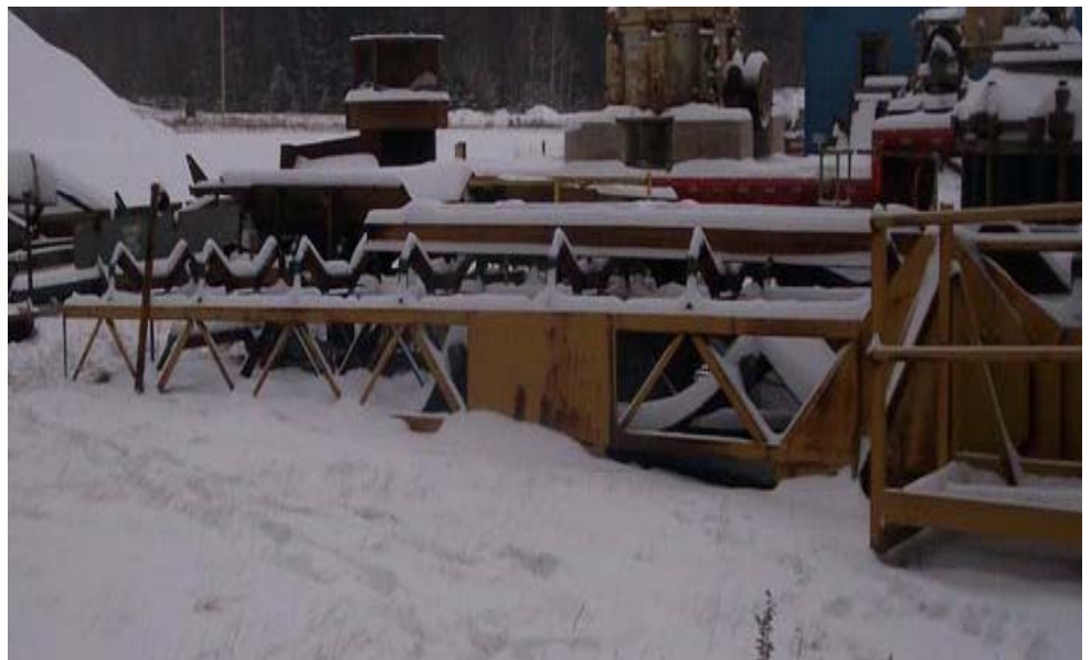
Pieces of scaffolding similar to those stolen