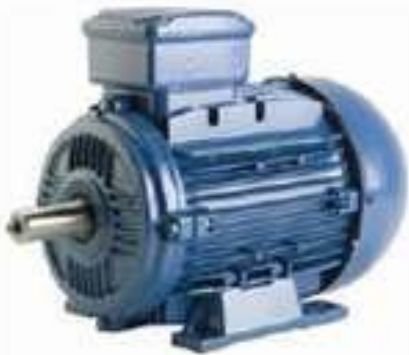
WEG 250hp motor

WESTERN MAINE: On Sunday morning (January 15 th ), the Maine State Police covered a THEFT from the yard of Pike Industries on the Bisbee Town Farm Rd. in Waterford (Oxford County). Stolen were two WEG 250hp electric motors, one gray and one blue. (Similar to the one shown below.) The motors contain a large amount of copper coils, but would need dismantling to get to the coils. Each motor weighs several hundred pounds. Also taken were several pieces of steel scaffolding/catwalk in gray with yellow handrails. The incident occurred sometime Saturday night/Sunday morning during a snow storm, and judging by the tire tracks, the suspect's vehicle was a PU truck (most likely a quad cab), towing a two axle trailer. Tracks also indicated three subjects were involved. If you have info on this theft please contact MSP Trooper Kyle Tilsley at Troop B: 657-3030.